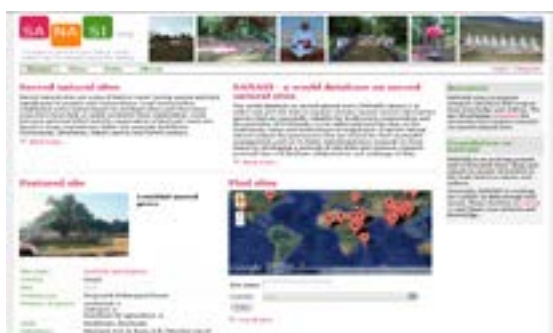
SANASI welcome page

The data currently available in SANASI are sourced from publications in scientific journals, from reports of national or international agencies, from books, and from the internet. The fundamental idea, however, is that individual researchers themselves can also contribute their data, after identifying and registering on SANASI's website.