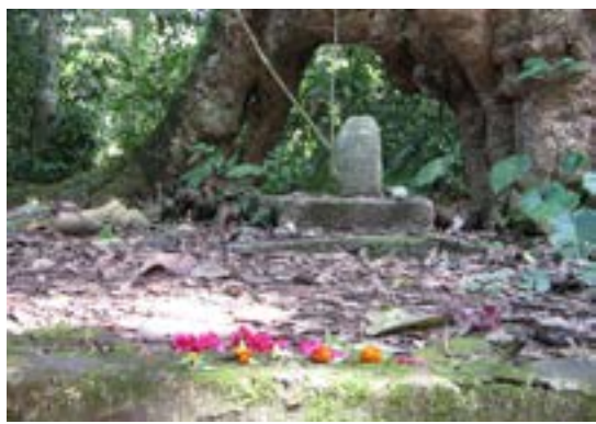
Sacred grove in the Western Ghats of India.