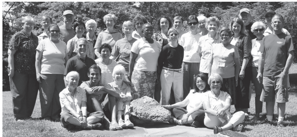
Ecological participants surround an ancient rock at Maryknoll