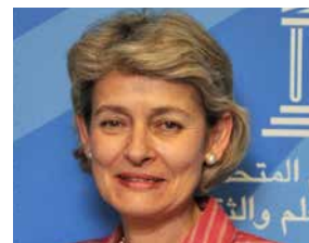
DR. MASOUMEH EBTEKAR Vice-President of the I.R. of Iran Head of the Department of Environment